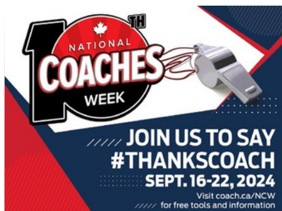
>> Facebook (Size: 1200x900)