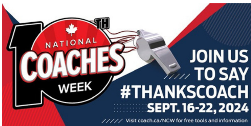
>> Twitter (Size: 1200x600)