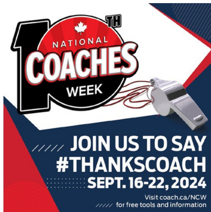
>> Instagram (Size: 1080x1080)