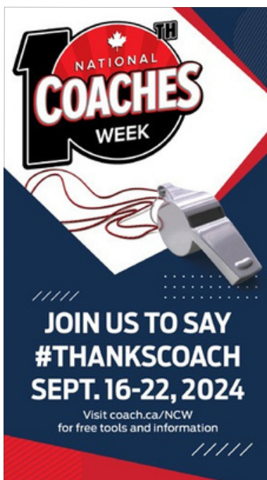
>> Tiktok (Size: 1080x1920)

Graphics help you promote National Coaches Week on your website, on social media, and on any other digital or print materials you may create. We have created the following graphic tools that will help you add a generic National Coaches Week graphic element to your promotions.