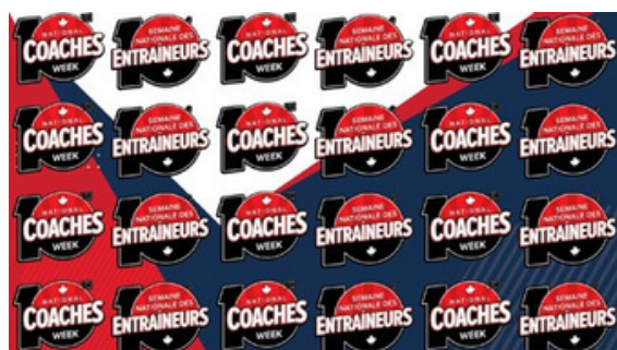
>> Zoom backdrop (1920x1080)