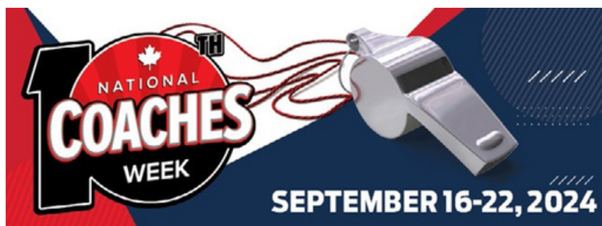
>> Social Media Cover (Size: 851x315)